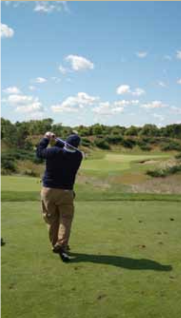
◀ Our Board of Governors held its 12th annual Chip in For Children golf outing, raising awareness and unrestricted funds for our important work in early childhood education.