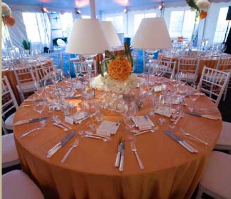
▲ The décor set the mood for an evening of fun and imagination that raised a record $785,000, including nearly $165,000 for our Early Childhood Connections program.